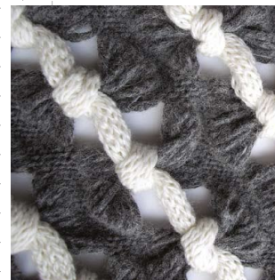
Swatch Carruthers Associates Autumn/Winter 2010

that to obtain enough cashmere yarn to knit a sweater the shorn wool of 6 to 7 goats is needed – and between 25 and 30 for a coat ?